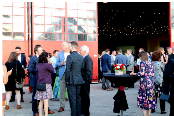
This year, our 7th Annual Gala was able to raise over $270,000 and hosted almost 500