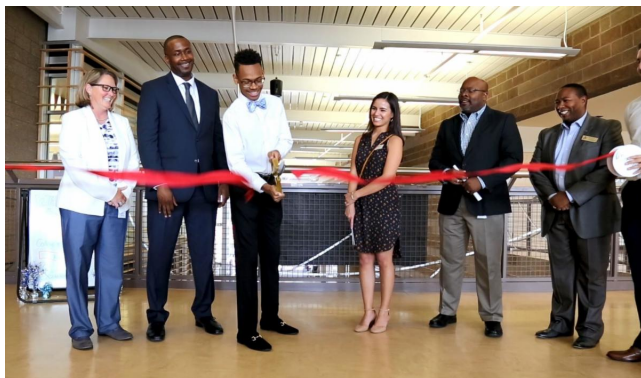
Vista PEAK Preparatory has officially opened up its College & Career Center! Below is a