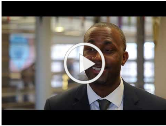
*Vista PEAK Ribbon Cutting Ceremony Video.

Aurora supporters. This surpassed our goal and broke all previous Gala records.